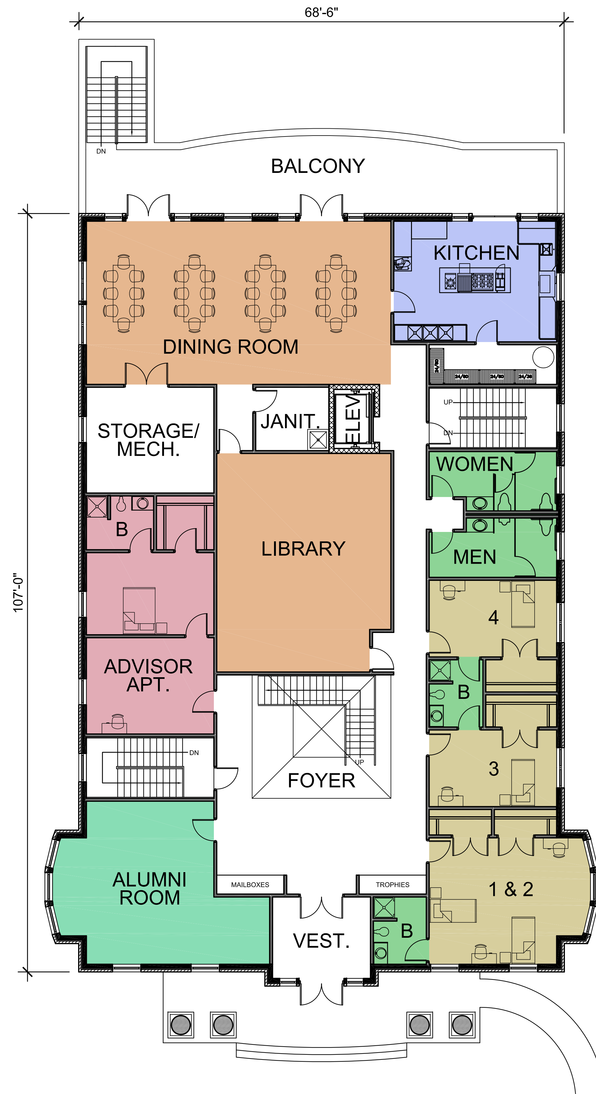
☐ 1st FLOOR PLAN 7,477 SQ. FT.